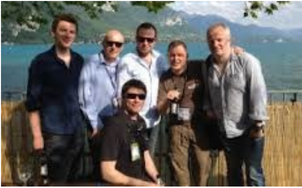
Some Irish animators at Annecy 2012.