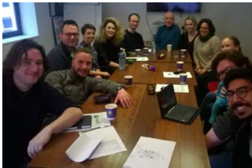
Above - typical AnimAl meeting.